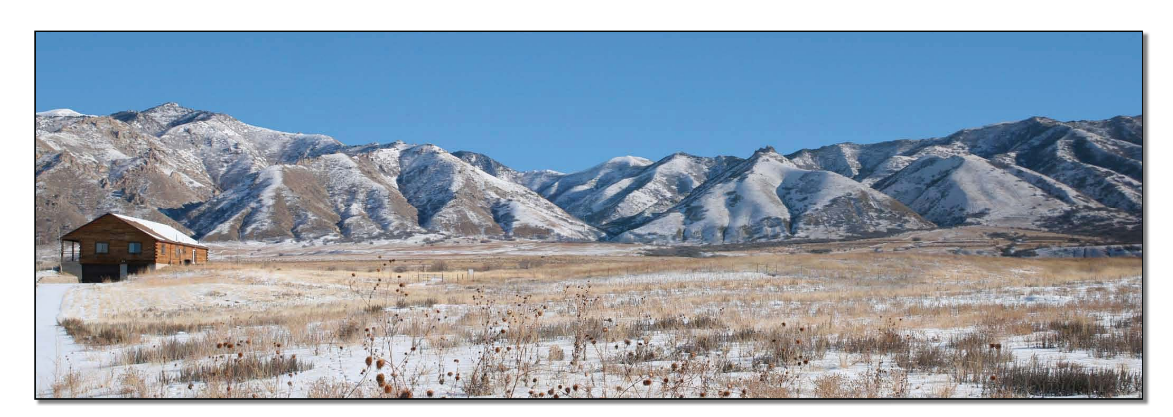
Simulated Condition – Typical 345kV transmission line crossing the NOMA.