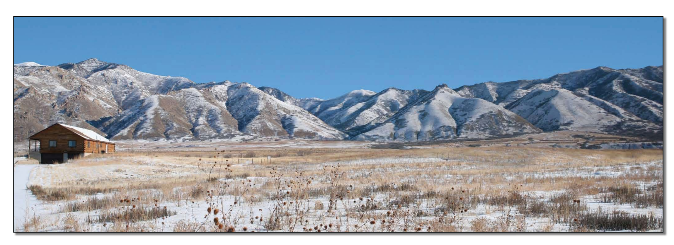
Existing Condition – Viewing east toward the North Oquirrh Managment Area (NOMA).