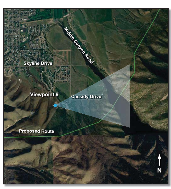
View Location: West end of Cassidy Drive, Tooele.