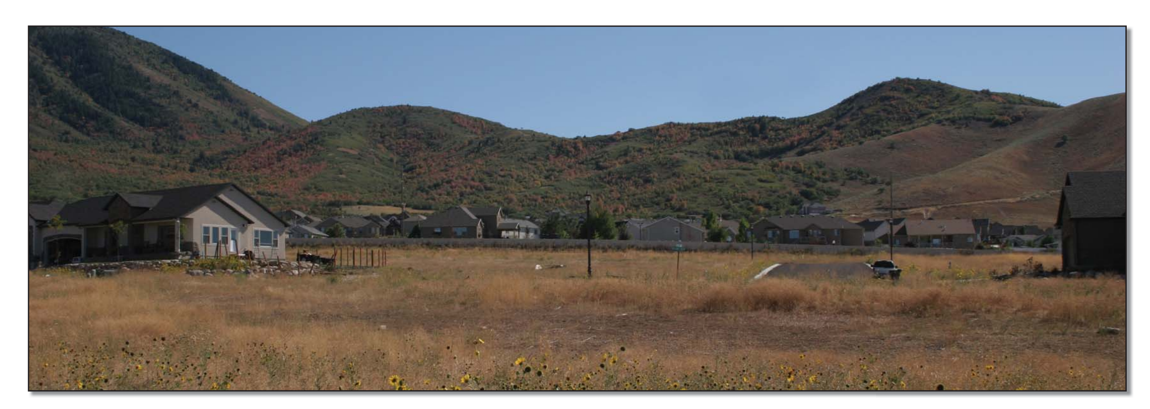
Existing Condition – Viewing south towards the Oquirrh Mountains.