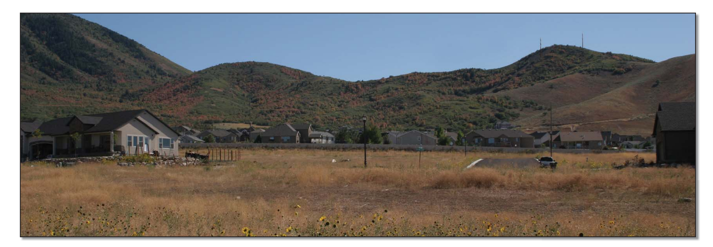
Simulated Condition – Proposed 345kV transmission line.