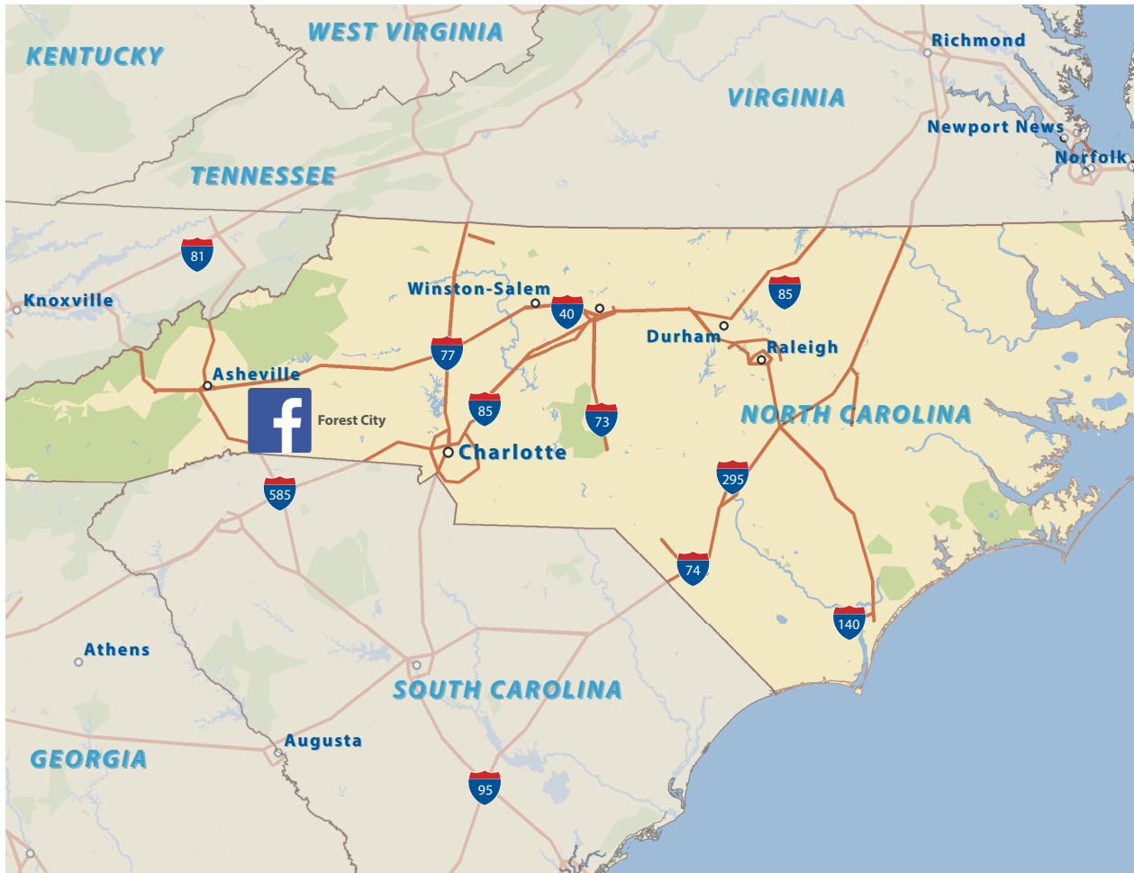
Figure 2. Forest City Data Center Location