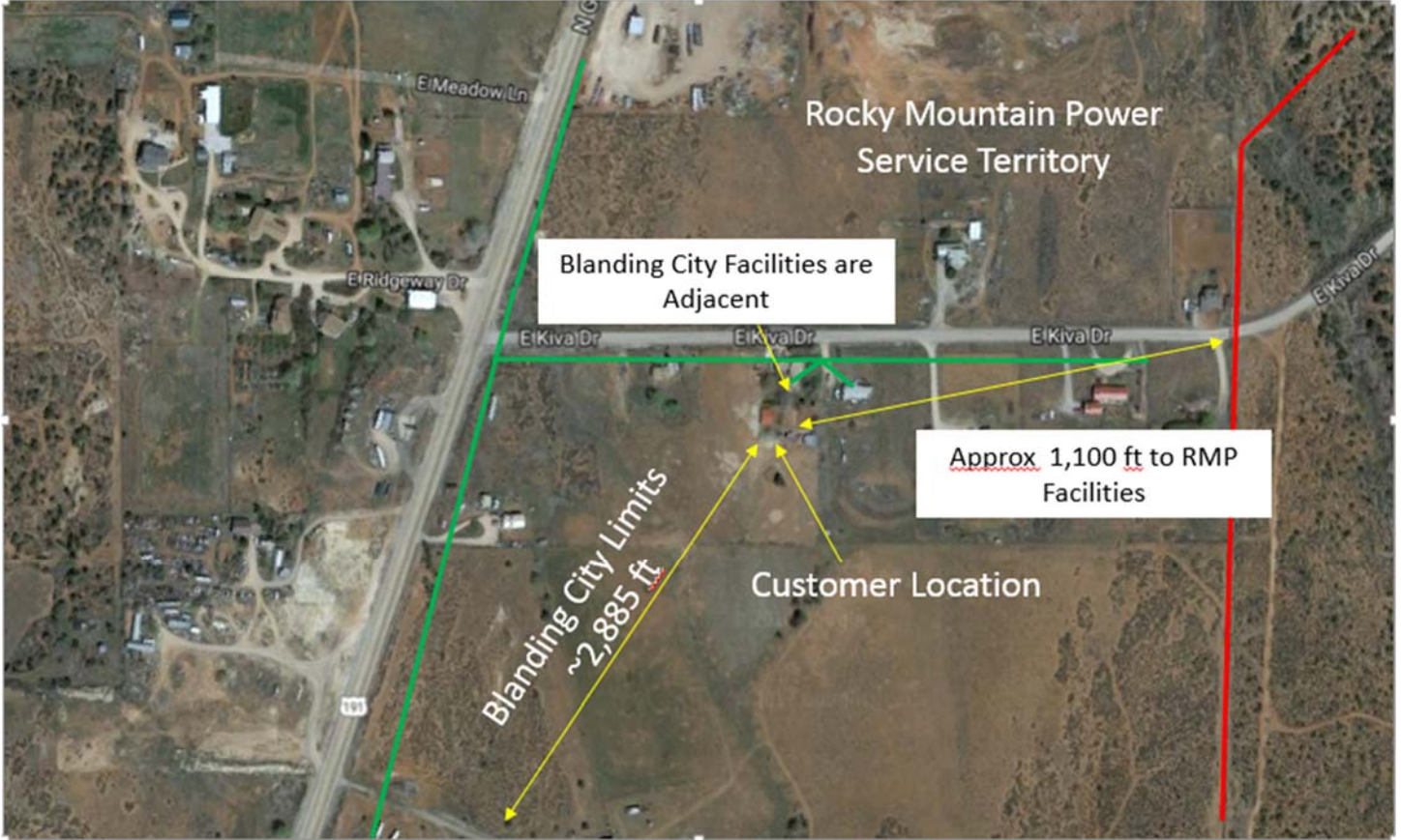
EXHIBIT B MAP OF SITE LOCATION