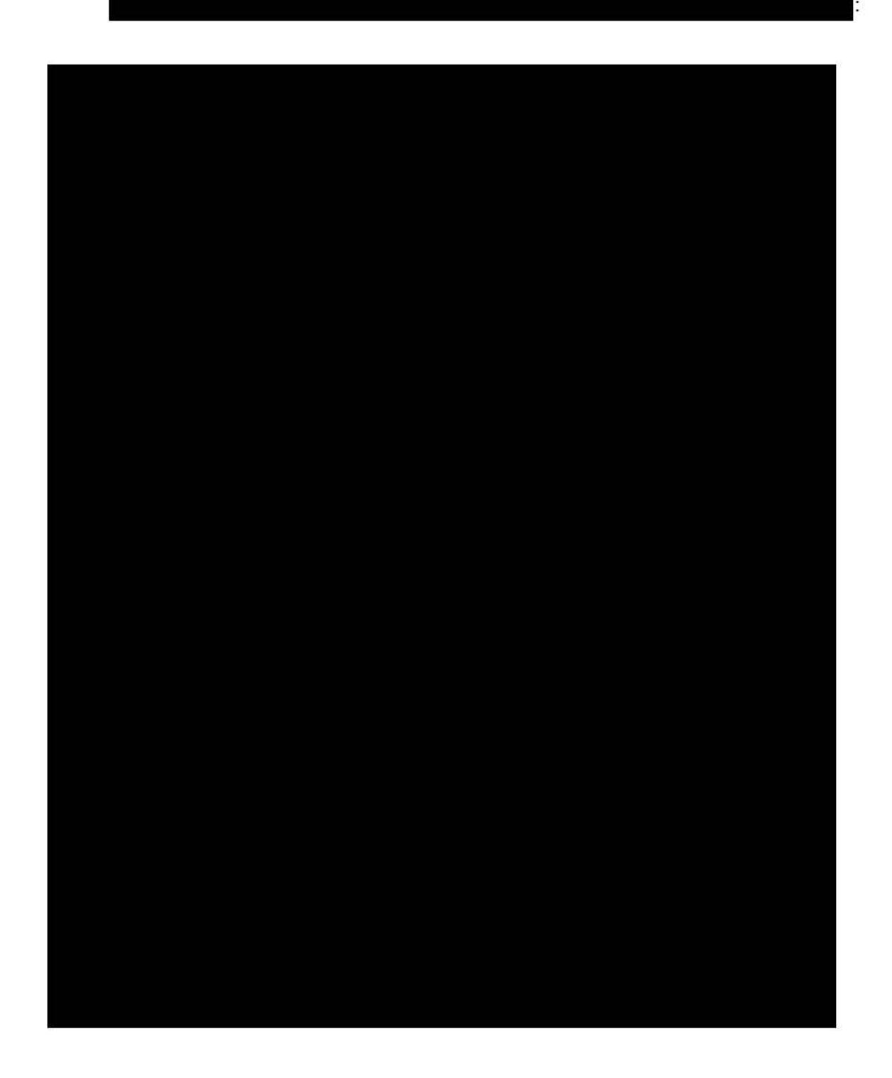
EXHIBIT B POINT OF DELIVERY / PARTIES' INTERCONNECTION FACILITIES