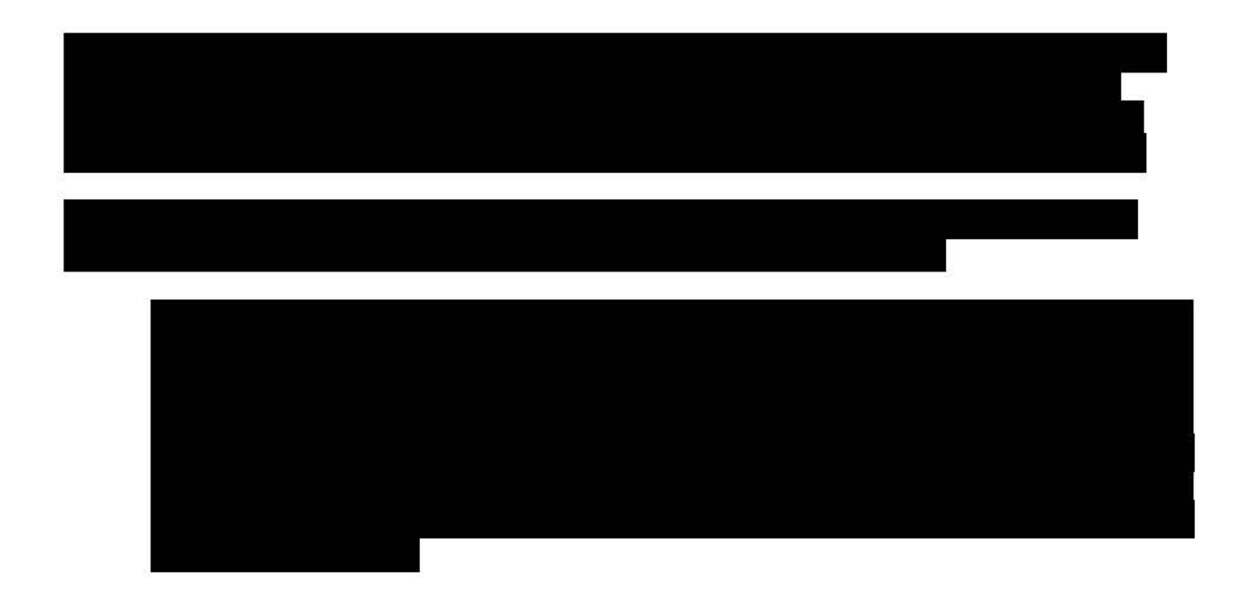
EXHIBIT A DESCRIPTION OF SELLER'S FACILITY