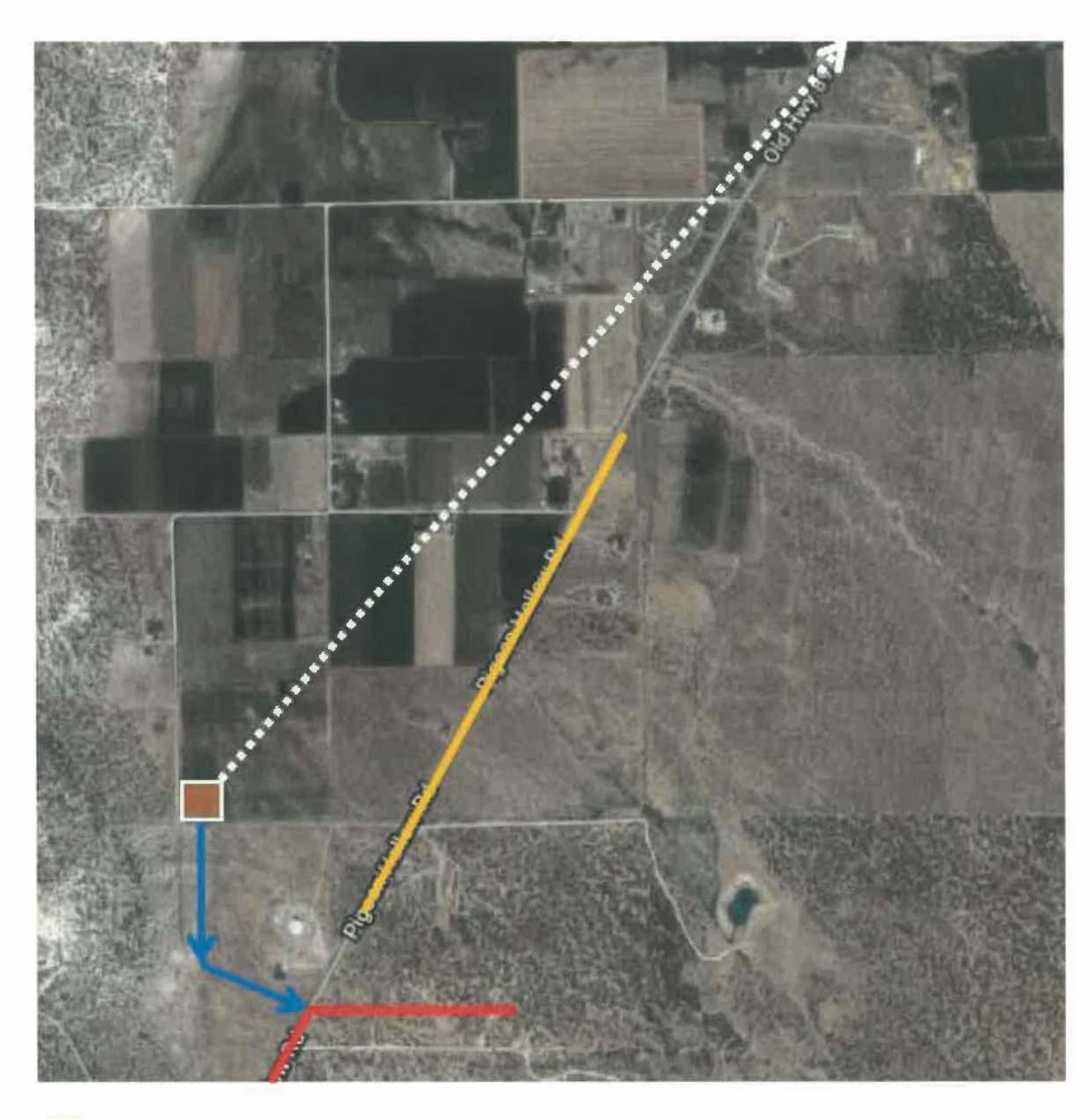
EXHIBIT B-2 MAP OF SITE LOCATIONS