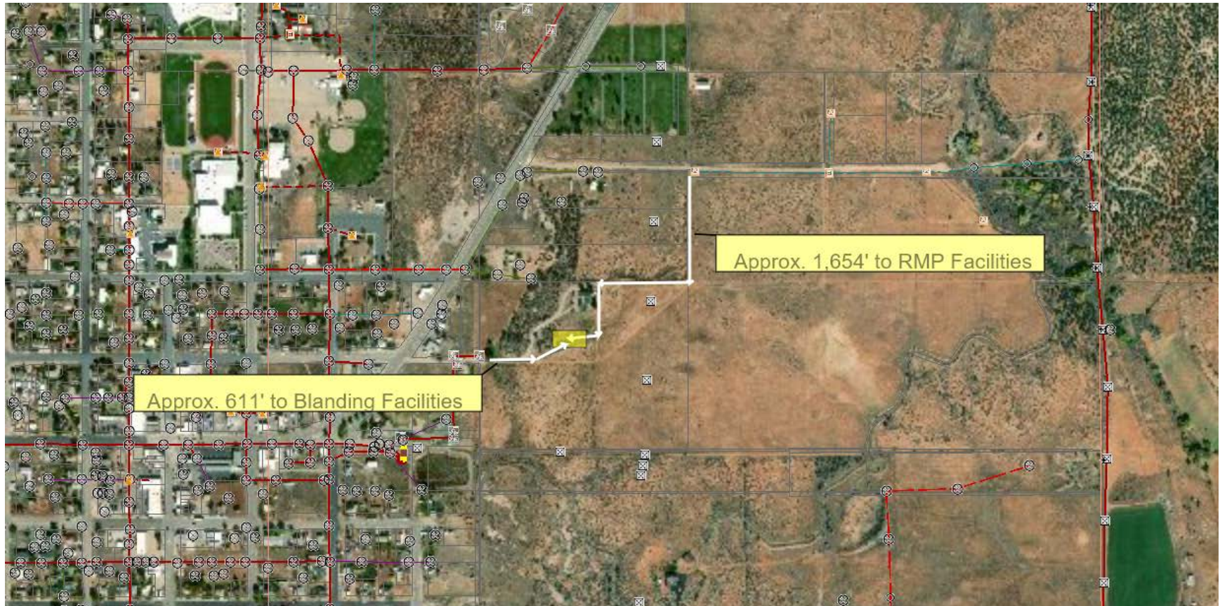
EXHIBIT B MAP OF SITE LOCATIONS