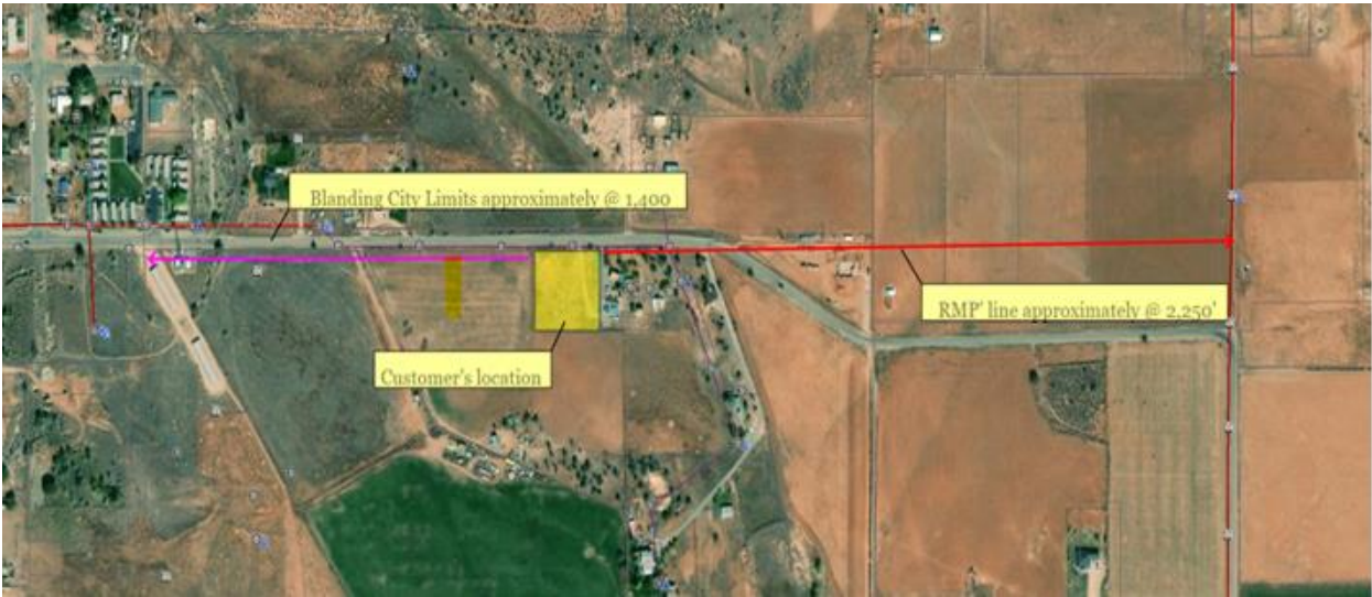
EXHIBIT B MAP OF SITE LOCATIONS