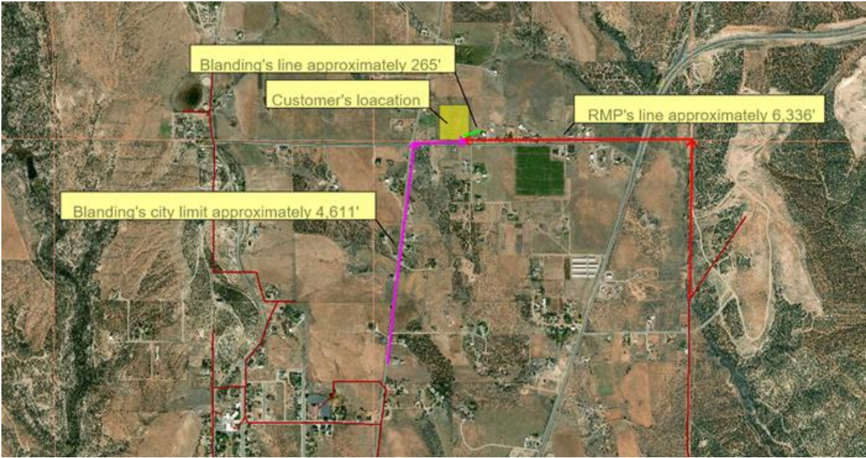
EXHIBIT B MAP OF SITE LOCATIONS