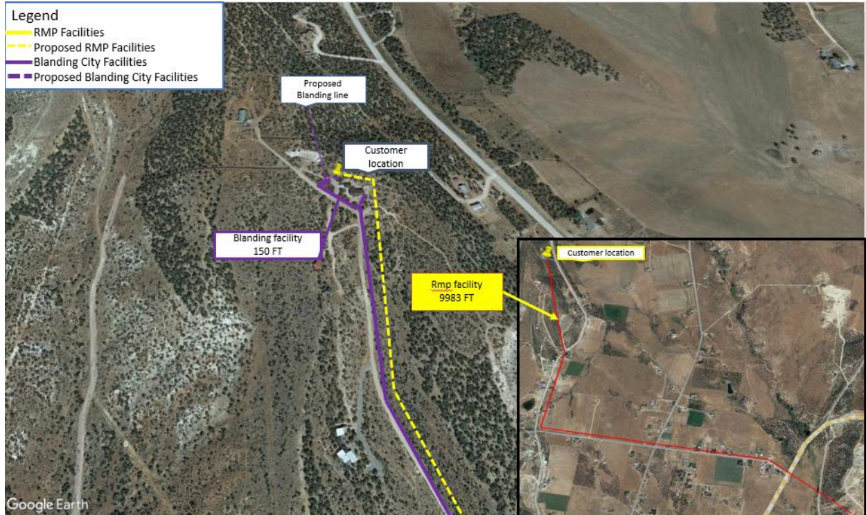
EXHIBIT B MAP OF SITE LOCATIONS