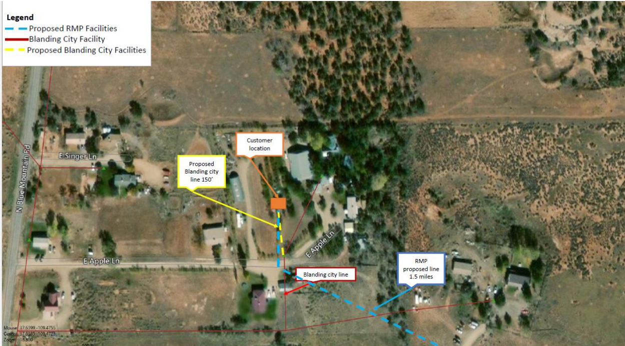
EXHIBIT B MAP OF SITE LOCATIONS