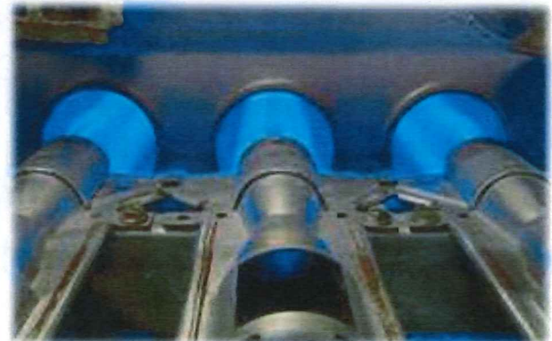
Making lives better by developing and delivering essential energy