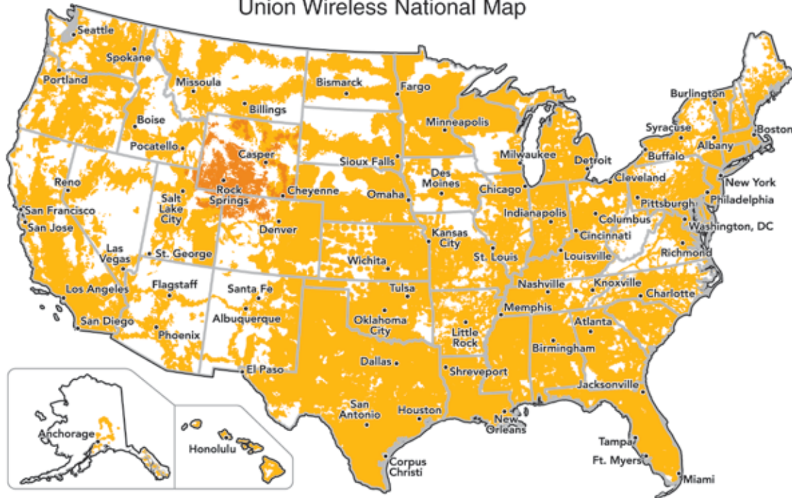
Union Wireless National Map

The Union Wireless Regional and National rate maps show approximately where rates apply and are not depictions of actual service availability or wireless coverage. The mapped territory contains areas with no service. Wireless coverage is subject to network and transmission limitations, including cell site unavailability, particularly in remote areas. Alaska has limited coverage on the National Map. Customer equipment, weather, topography and other conditions can effect service area. Actual coverage may vary. When digital service is not available, your device may not operate or be able to make 911 calls. All features may not be available in all areas. Some features include airtime and domestic long distance charges.