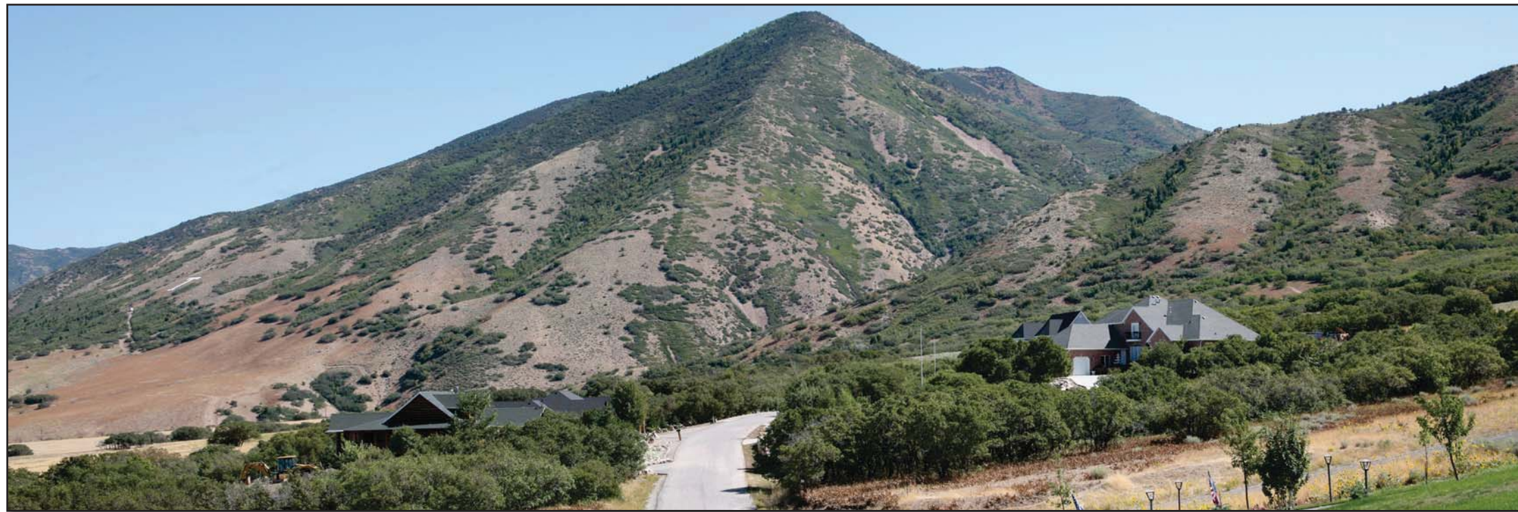
Existing Condition – Viewing east towards Middle Canyon and Oquirrh Mountains.