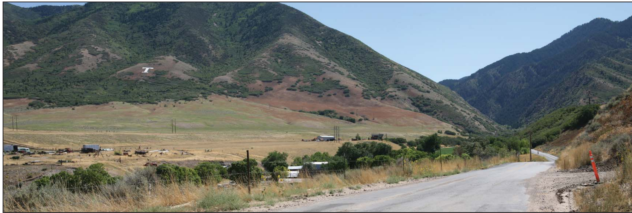
Existing Condition – Viewing east, southeast towards Middle Canyon and the Oquirrh Mountains.