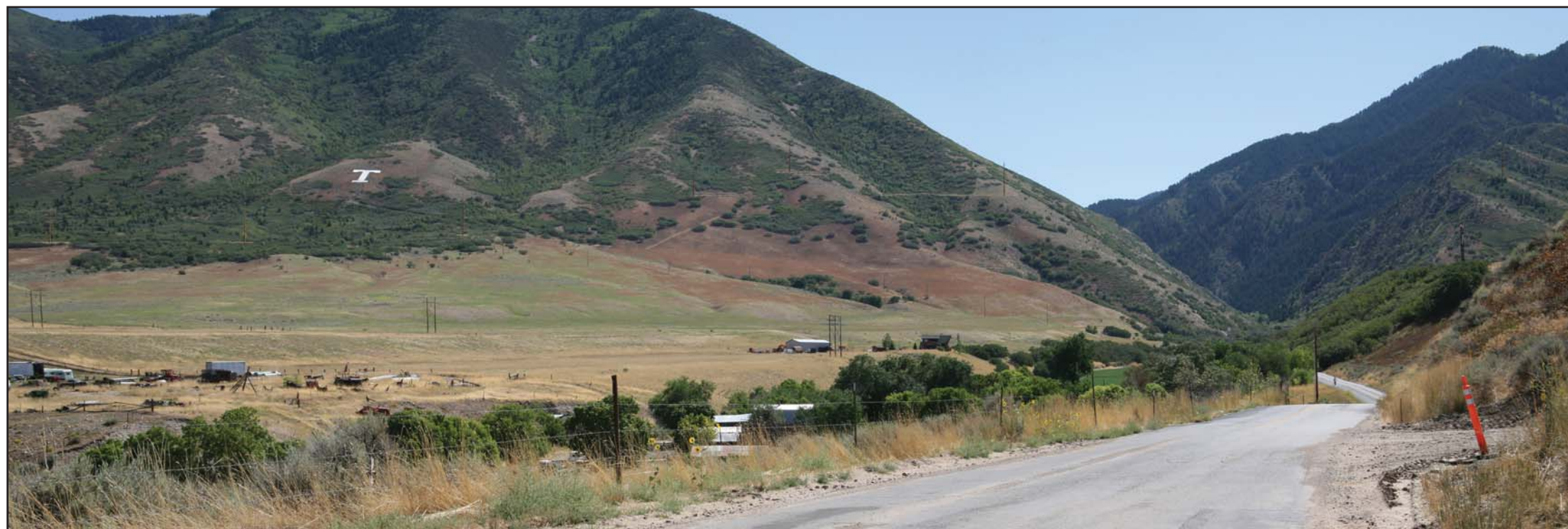
Simulated Condition – Proposed 345kV transmission line.