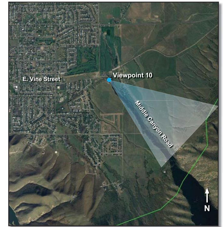
View Location: Middle Canyon Road at Oquirrh Hills Golf Course.