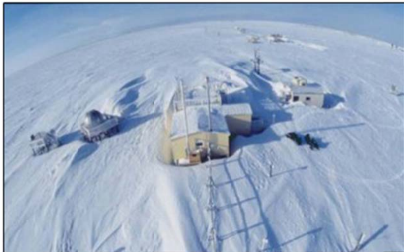
At NOAA’s atmospheric baseline observatory in Barrow, Alaska, captured here by fisheye lens, the concentration of the greenhouse gas carbon dioxide reached 400 ppm in April 2012, the first time a monthly average at one of NOAA’s remote monitoring sites reached the 400 mark. Carbon dioxide levels are steadily increasing in the atmosphere due to human activities, primarily the burning of fossil fuels.

Measurements at all those remote sites reflect background levels of CO 2 , influenced by long-term human emissions around the world, but not directly by emissions from a nearby population center. At other