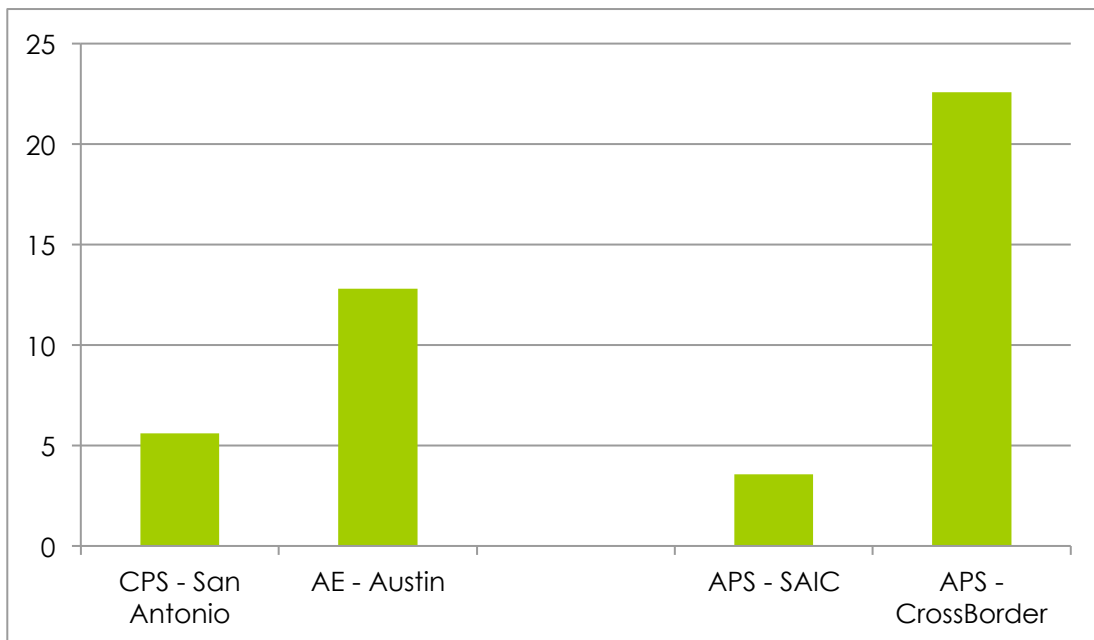
Figure 1: Disparate DSG Valuations in Texas Studies (cents/kWh).

The figure above shows that Austin Energy's latest valuation of 12.8 cents per kWh is 150% greater than the 5.1 cent valuation by City Public Service in San Antonio, just 80 miles away. Even more dramatic is the difference in DSG values for APS, with 3.56 cents by the utility consultant and a range of 21.5 to 23.7 cents by the solar industry consultant.