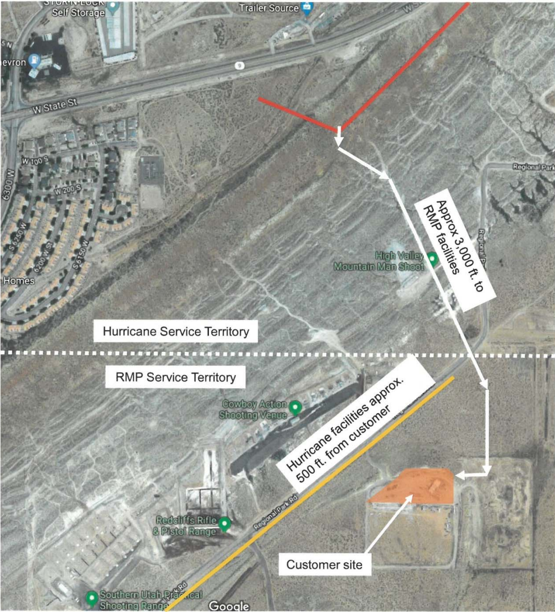
EXHIBIT B MAP OF SITE LOCATIONS