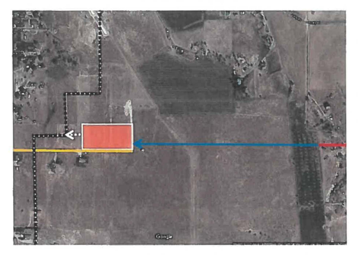
EXHIBIT B-1 MAP OF SITE LOCATIONS