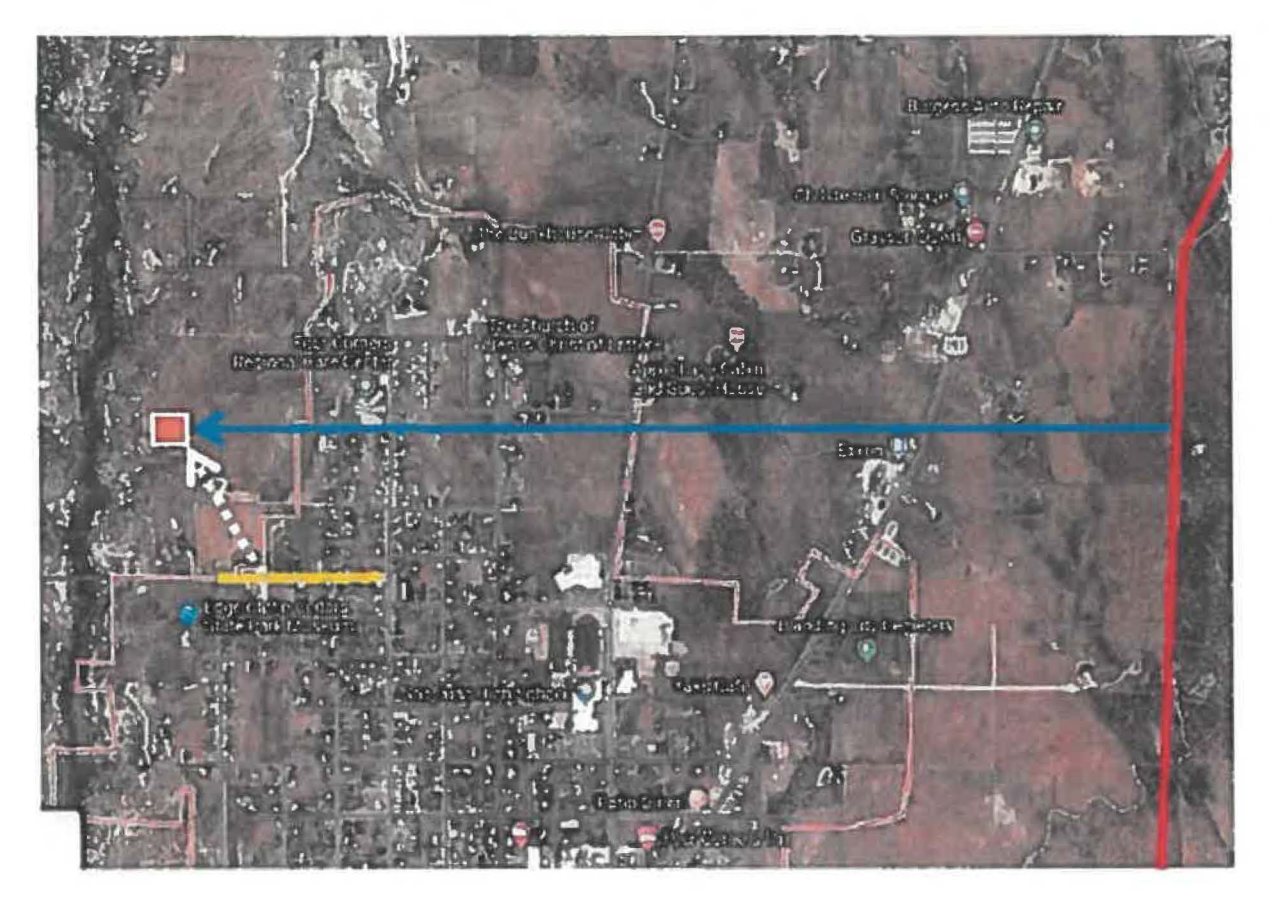
EXHIBIT B-2 MAP OF SITE LOCATIONS