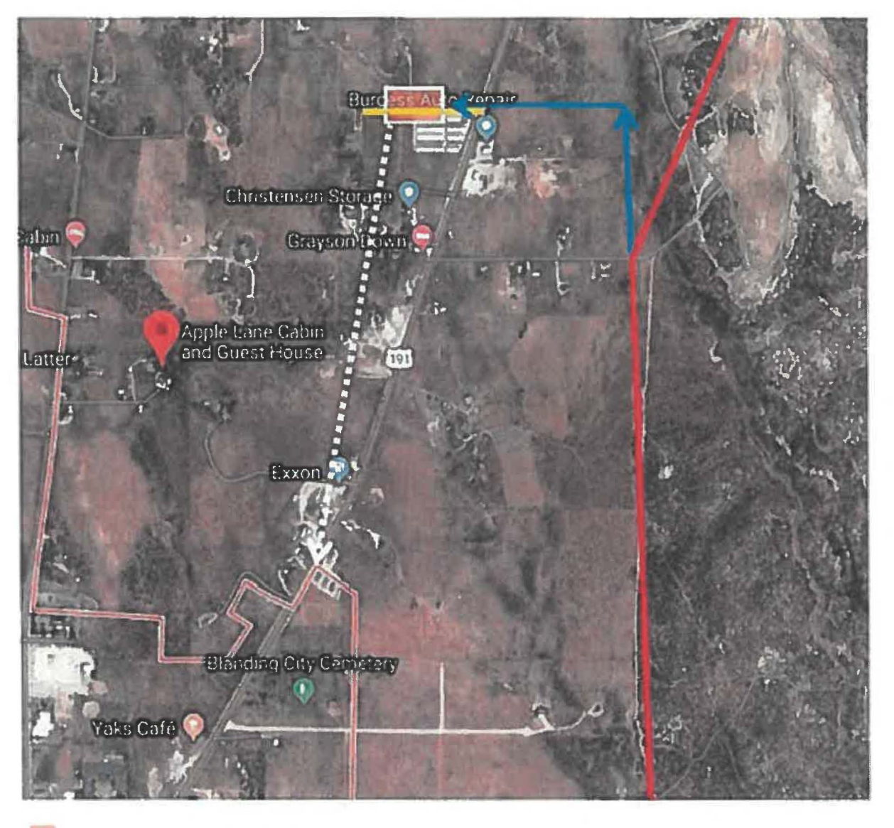
EXHIBIT B-3 MAP OF SITE LOCATIONS