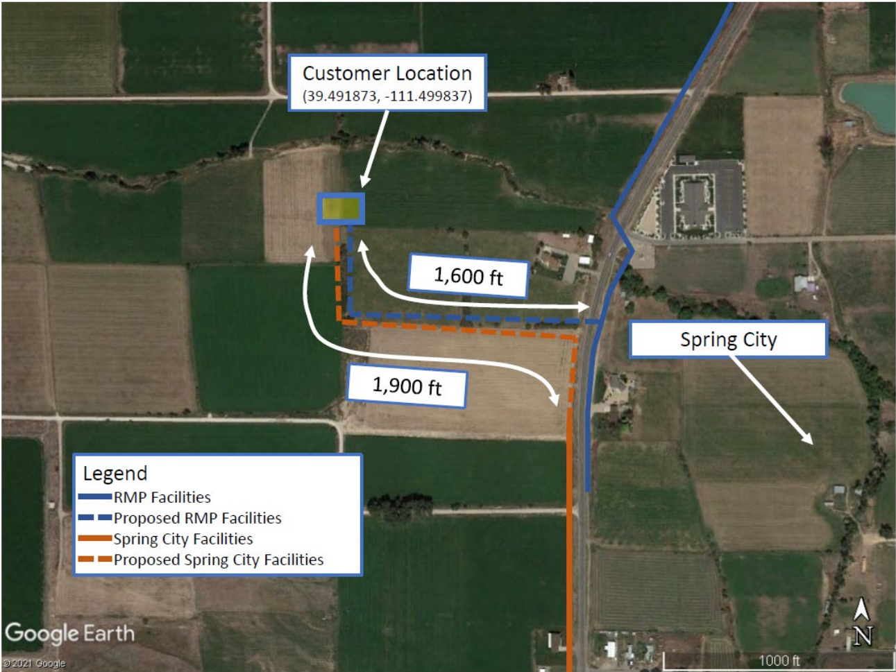
EXHIBIT B MAP OF SITE LOCATIONS