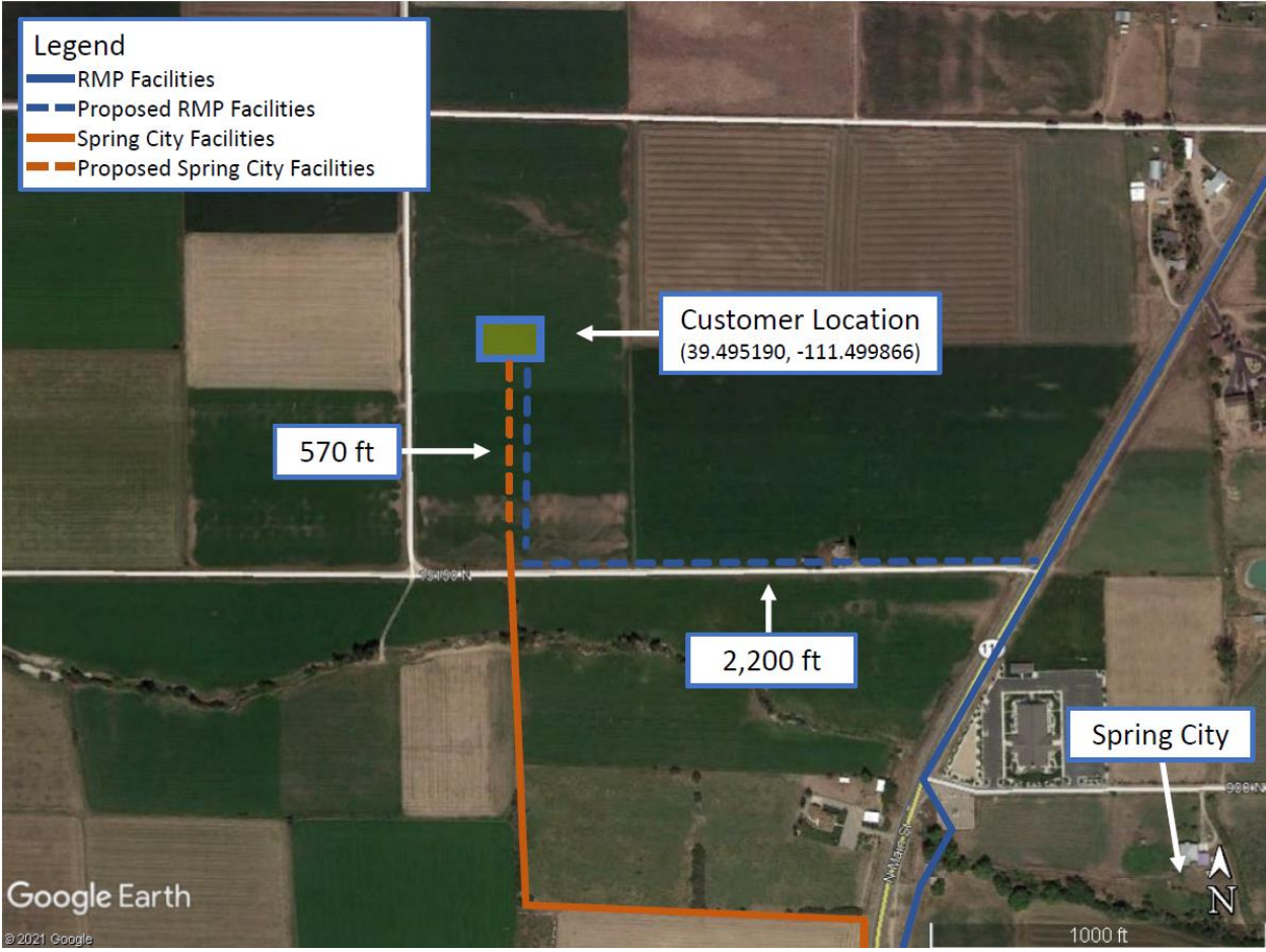
EXHIBIT B MAP OF SITE LOCATIONS