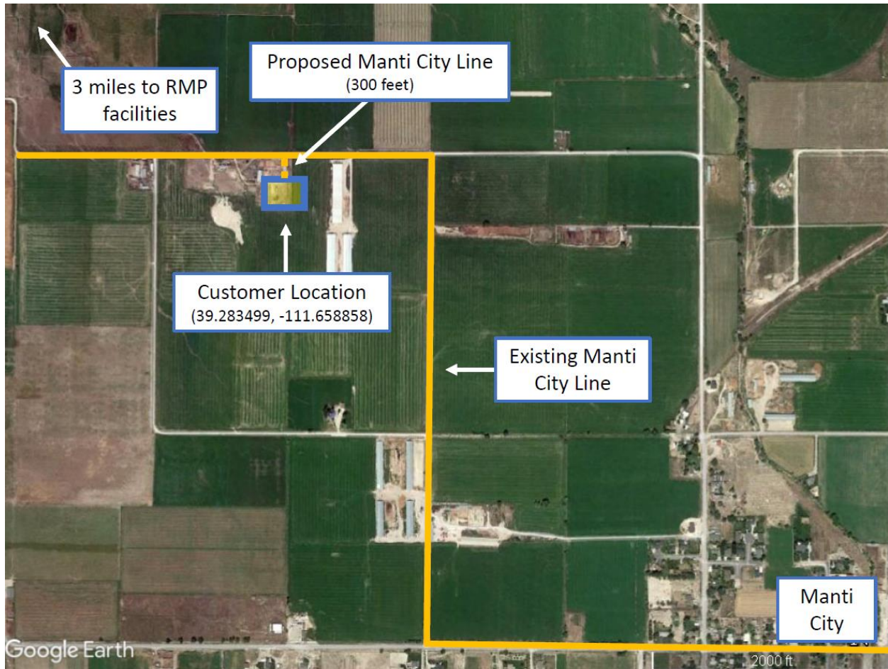
EXHIBIT B MAP OF SITE LOCATIONS