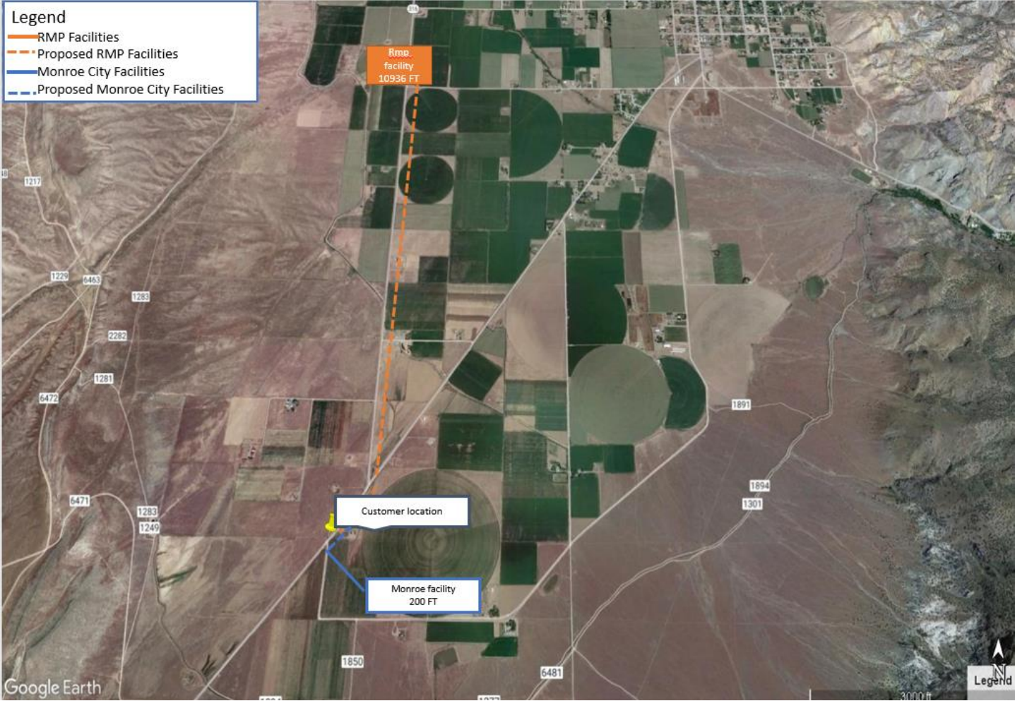
EXHIBIT B MAP OF SITE LOCATIONS