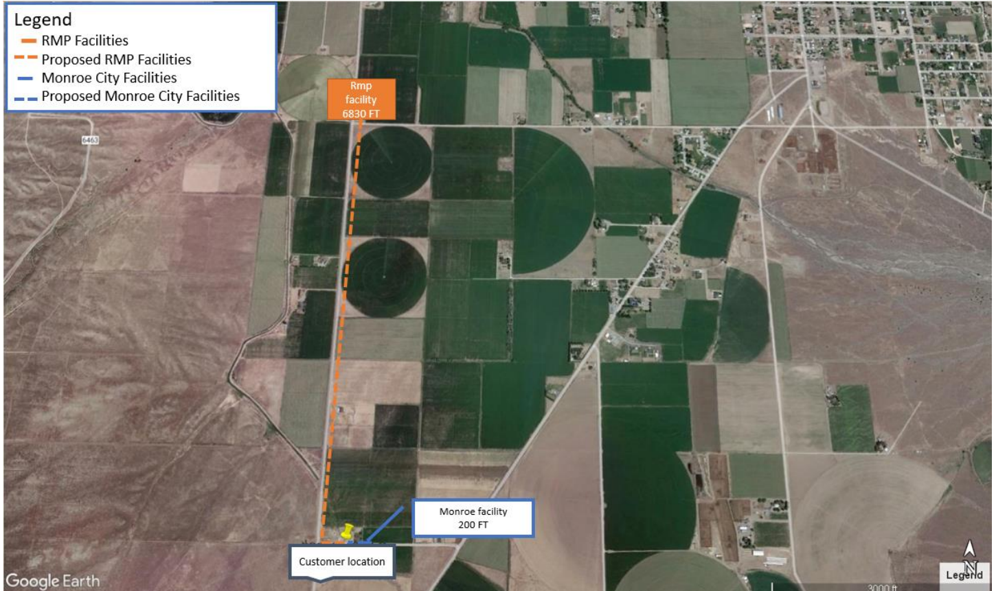
EXHIBIT B MAP OF SITE LOCATIONS