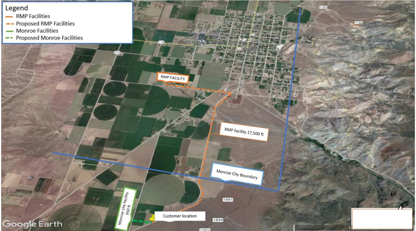
EXHIBIT B MAP OF SITE LOCATIONS