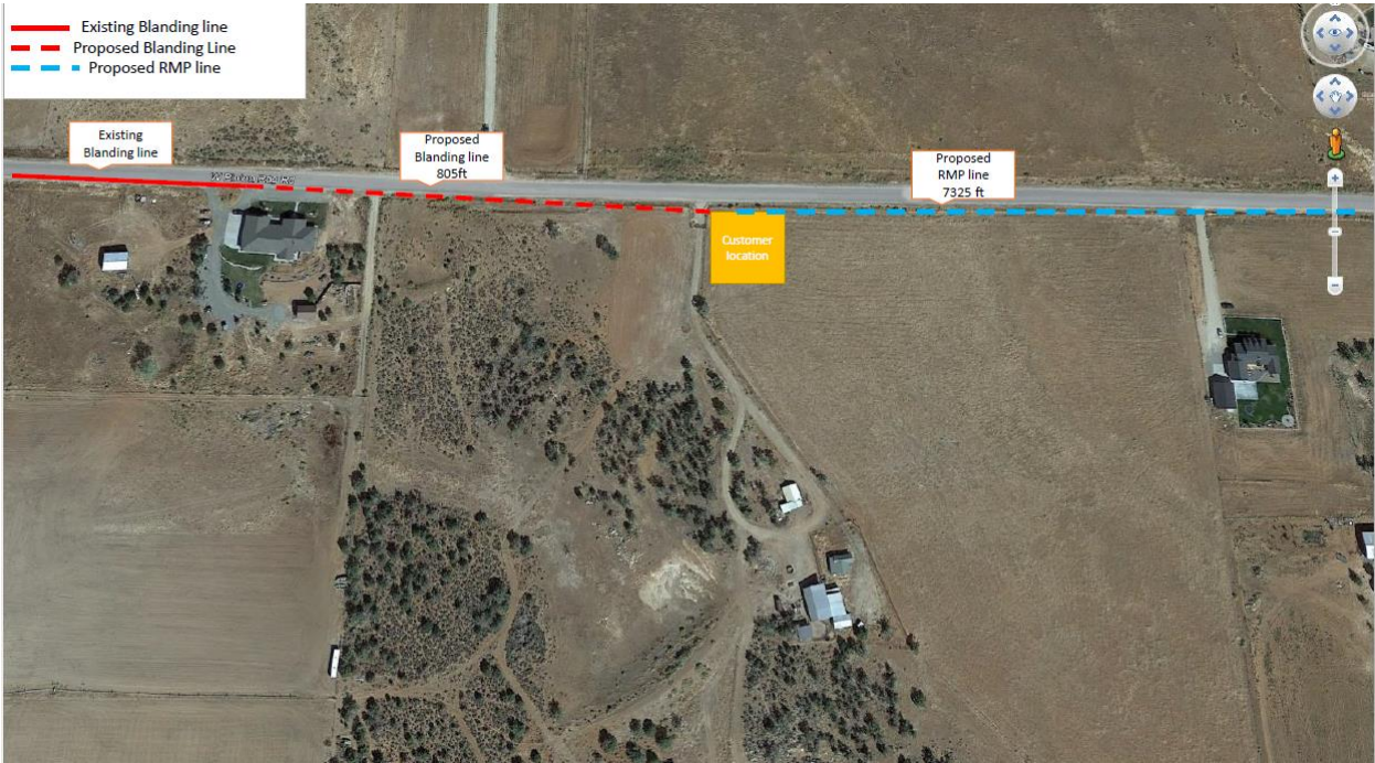
EXHIBIT B MAP OF SITE LOCATIONS