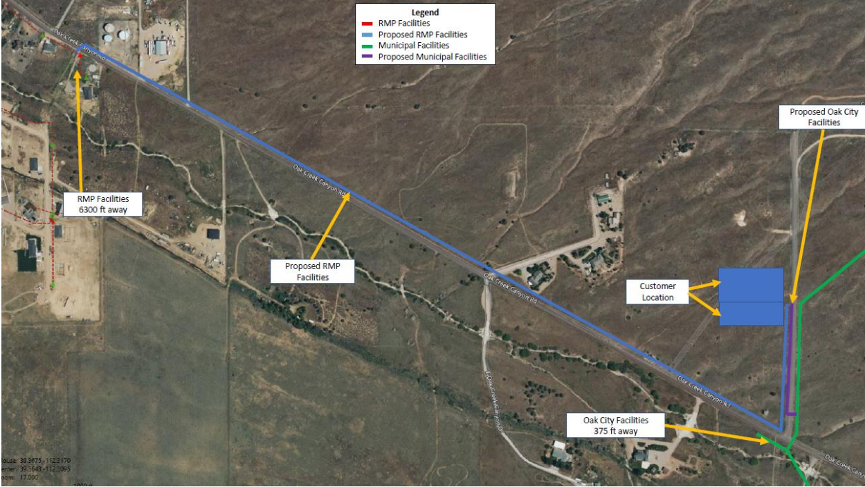
EXHIBIT B MAP OF SITE LOCATIONS