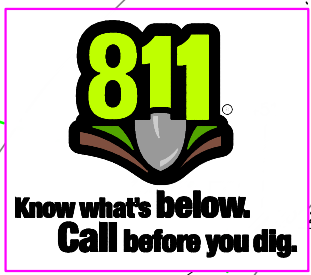
EXHIBIT "A" SIGNED: _____ TITLE: _____ DATE: _____