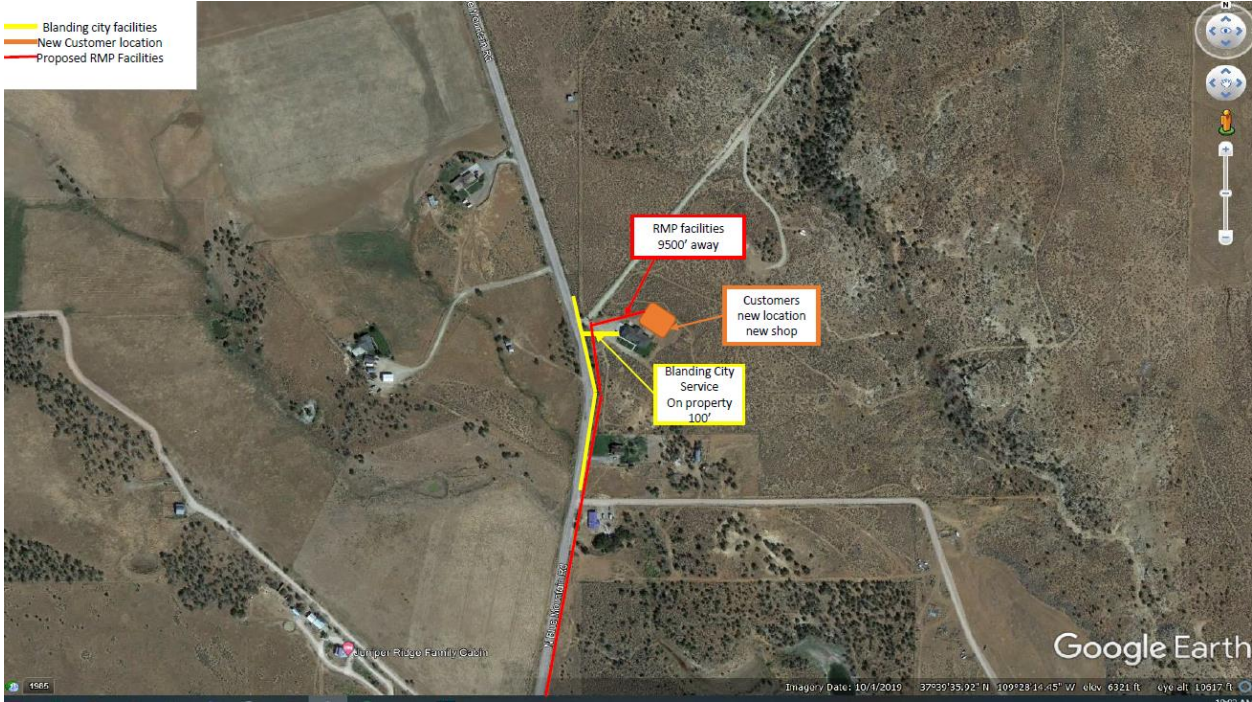
EXHIBIT B MAP OF SITE LOCATIONS