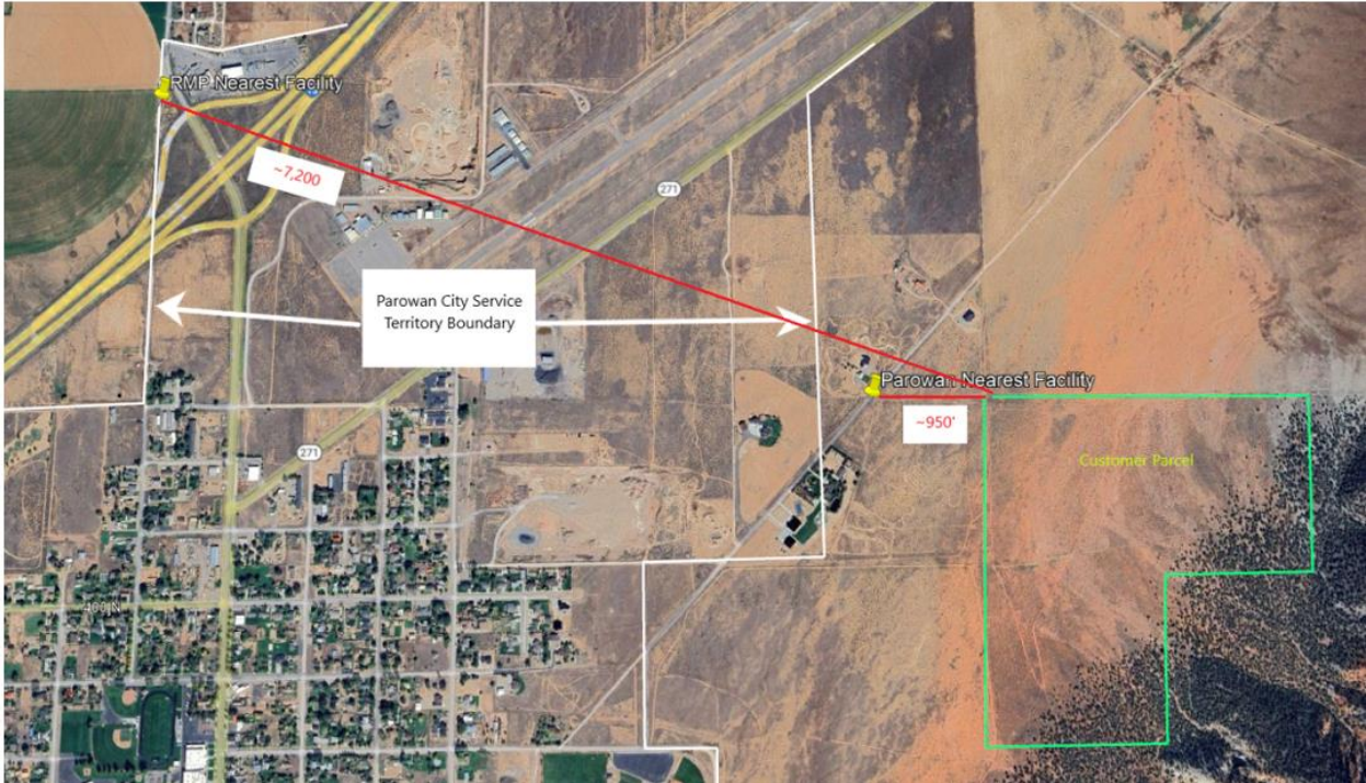
EXHIBIT B MAP OF SITE LOCATIONS