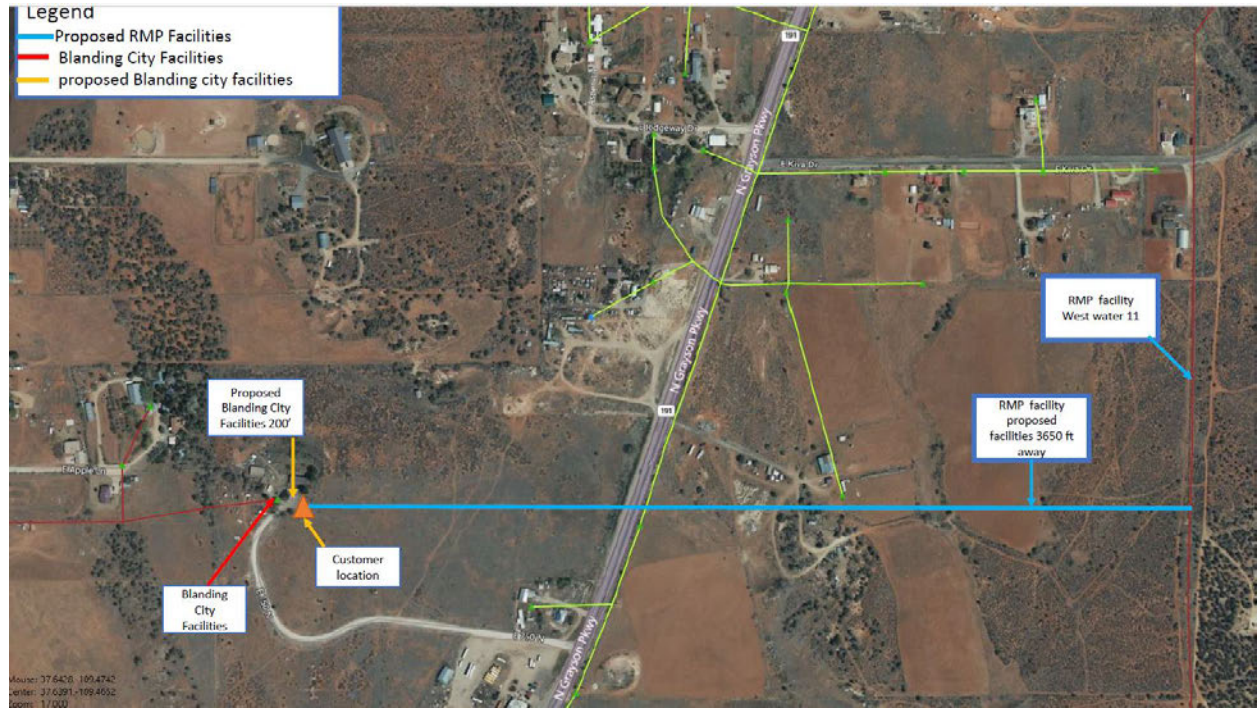
EXHIBIT B MAP OF SITE LOCATIONS