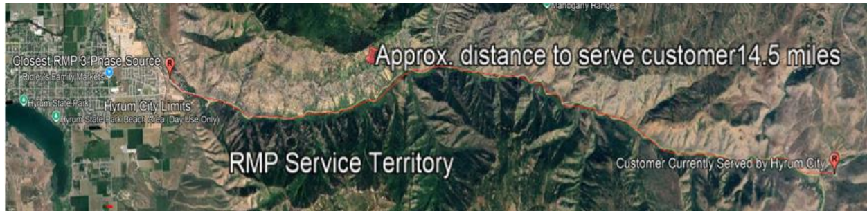
EXHIBIT B MAP OF SITE LOCATIONS