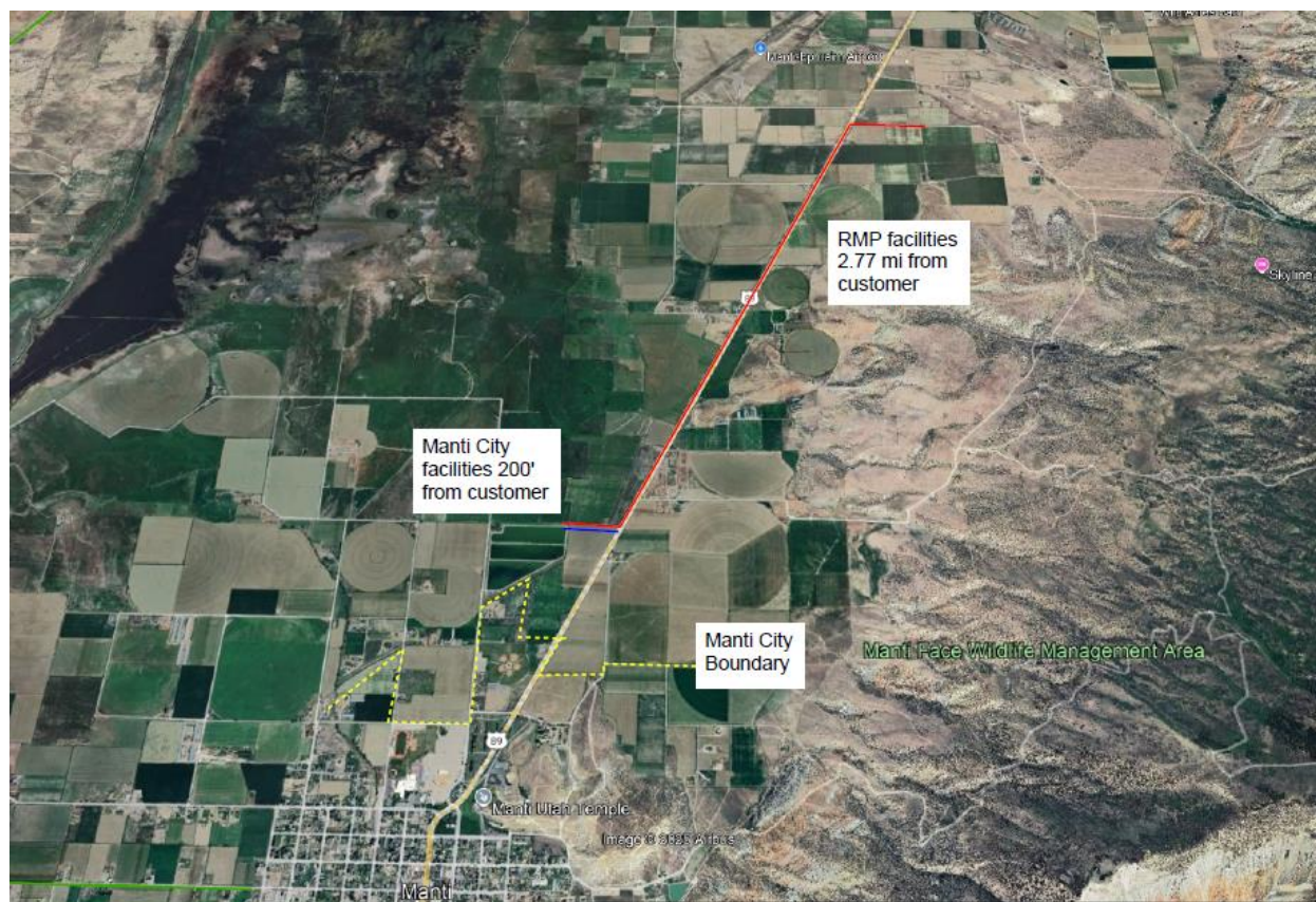
EXHIBIT B MAP OF SITE LOCATIONS