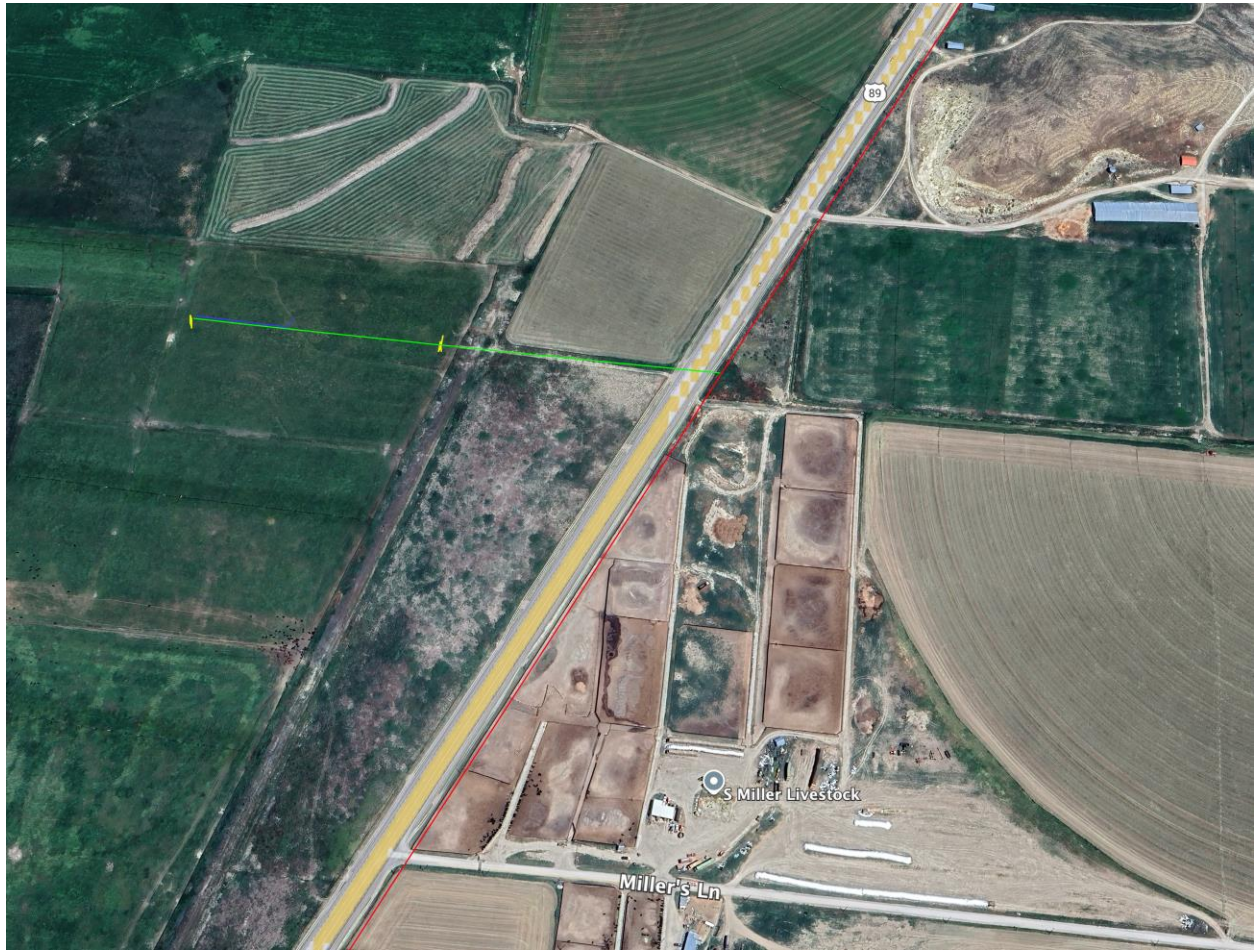
EXHIBIT B MAP OF SITE LOCATIONS