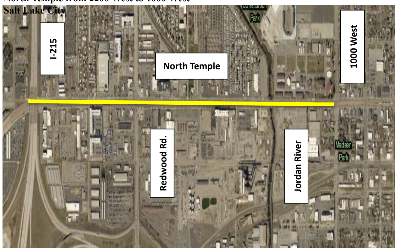
BL28 Replacement North Temple from 2200 West to 1000 West

Dominion Energy Utah Docket No. 21-057-27 Exhibit 3 Page 7 of 8