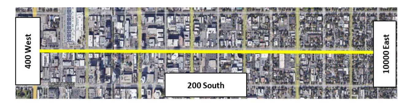
BL7 200 South 1000 East to 400 West Salt Lake City

Dominion Energy Utah Docket No. 21-057-27 Exhibit 3 Page 8 of 8