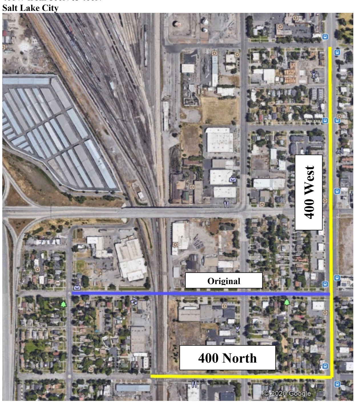
BL29 Replacement re-route 400W from 800N to 400N

Dominion Energy Utah Docket No. 21-057-27 Exhibit 3 Page 6 of 8